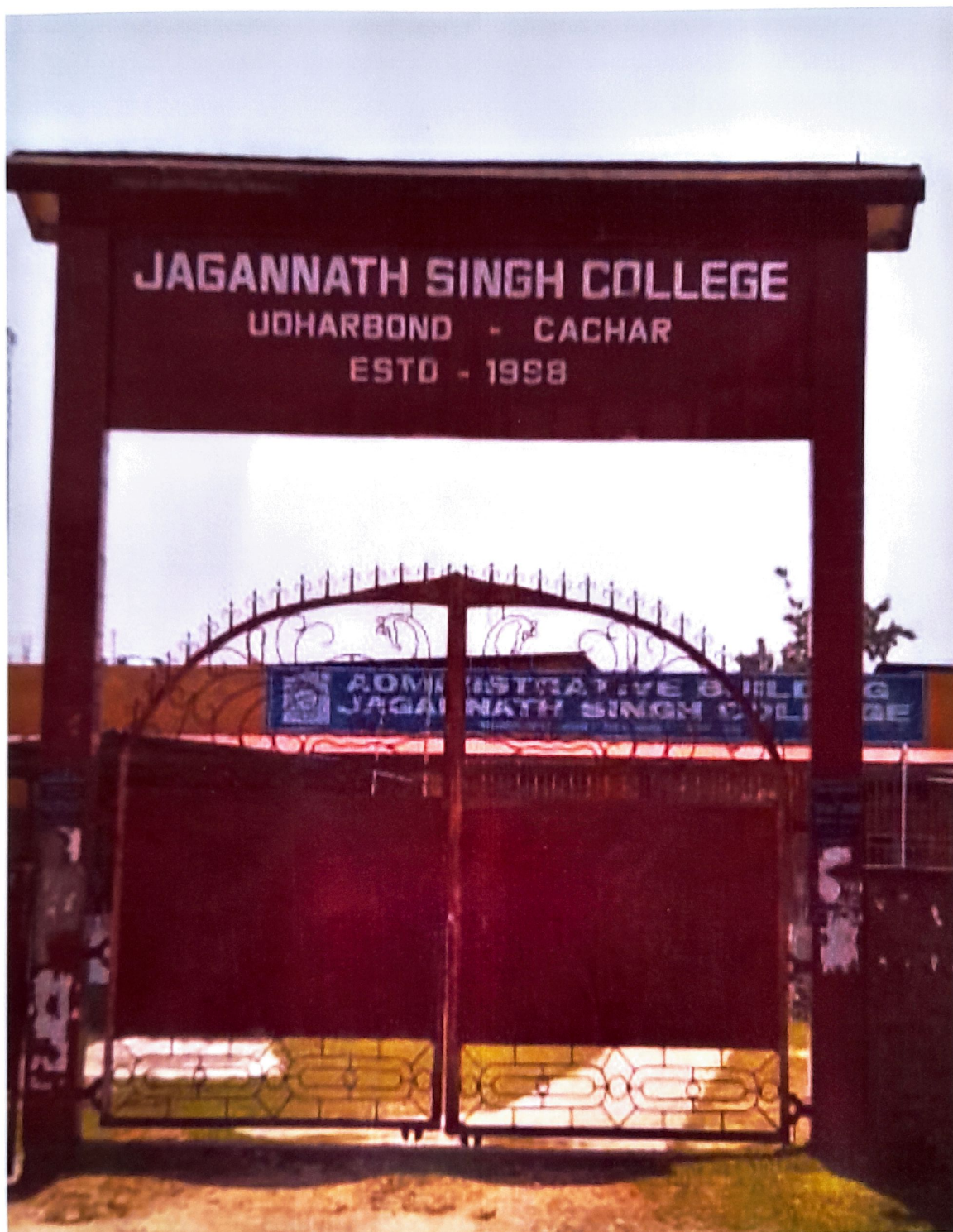
Entry gate of the College